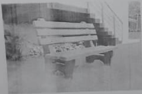
PRECAST CONCRETE BENCH