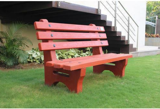
PRECAST CONCRETE BENCH